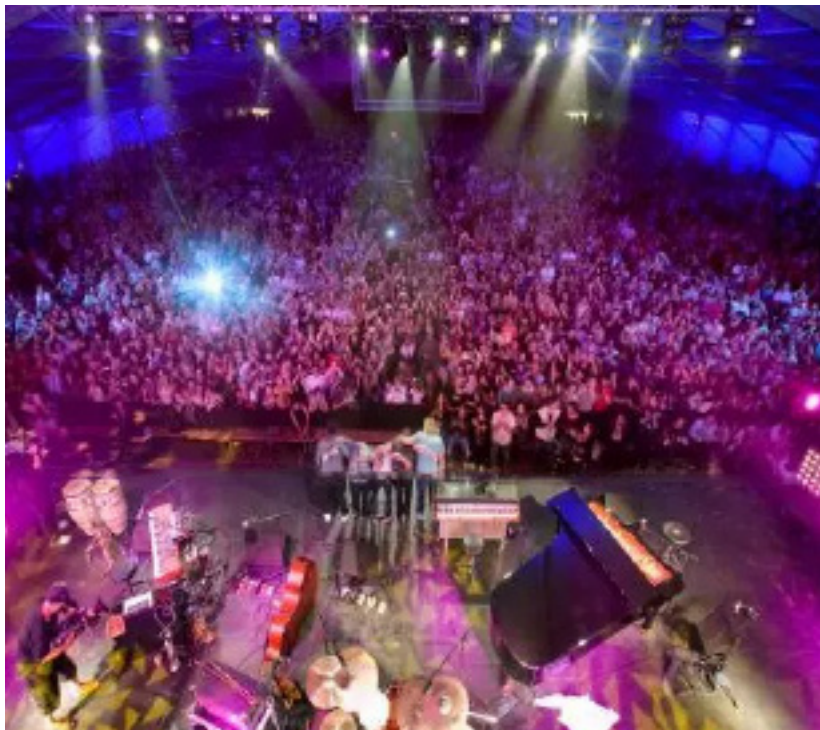
The Bud Shank Sextet performed at the Marciac Jazz Festival in Occitania, France on August 13, 2000